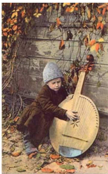
LITTLE KOBZAR. (Early printed postcard)

After the minstrel had concluded his performance or his meal, he would sing a song of thanks and farewell ( blahodarinne ) and proceed to the next household. When night fell, the minstrel would sleep in the home of the local kobzar or lirnyk or at the church. The next day he would sing at other homes in the same village or travel on down the road to the next one.