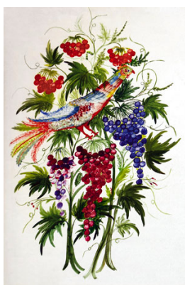
Bird and flowers.