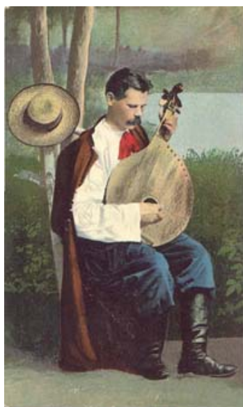
KOBZAR. (Early printed postcard) (Private collection)

They were the repositories of tradition and culture. They were the disseminators of the word of God and the major source of folk historical and religious information. Ukrainian singers were disabled people who used minstrelsy as a social welfare institution, and yet many among them were true artists, great performers.