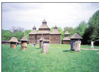
Voskresinska Church of the 18th century from the Land of Polissya (now in the open-air Museum of Folk Architecture) is architecturally a combination of Baroque and very archaic features.

Ukrainian church builders used the simplest of tools to create their architectural wonders – axes, drills and augers, planes, saws and carpenters plumb lines. In many cases, the evidently did without saws and other construction elements are tightly that it is impossible, no matter is, to stick the blade of a knife between the logs or planks.