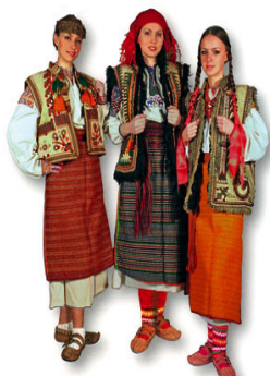
Hutsul women wearing holiday dresses.

Probably the first dress is that men like than women. The braided colored falcons, with that shake and Men's shirts