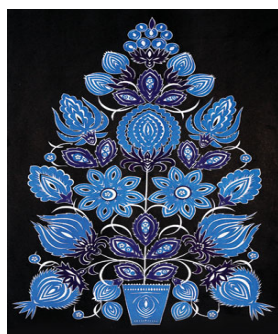
Blue Flowers by Mariyeta Valeshyna from the village of Tsarytsanka, Dnipropetrovsk Oblast. Paper vytynanka, 38 x 48 cm, 2008.

The word itself, the early twentieth century, regional words that were or kvity to mention but a of many kinds and people, animals and plants.