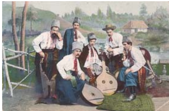
KOBZARI. (Early printed postcard) (Private collection)

The heart and soul of Ukraine is its countryside: the black, fertile soil; the fields of golden wheat dotted with the red of poppy flowers and the blue of cornflowers; the white adobe houses with thatched roofs; the sparkling blue streams. In the late nineteenth and early twentieth centuries, this countryside was peopled with the usual peasants, craftsmen, and peddlers, but also with others who were unique -- blind, mendicant minstrels.